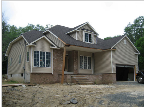
Construction Photo 2