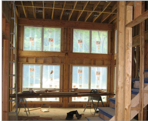
Construction Photo 1